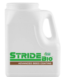
8# Shaker (will be grey in color)